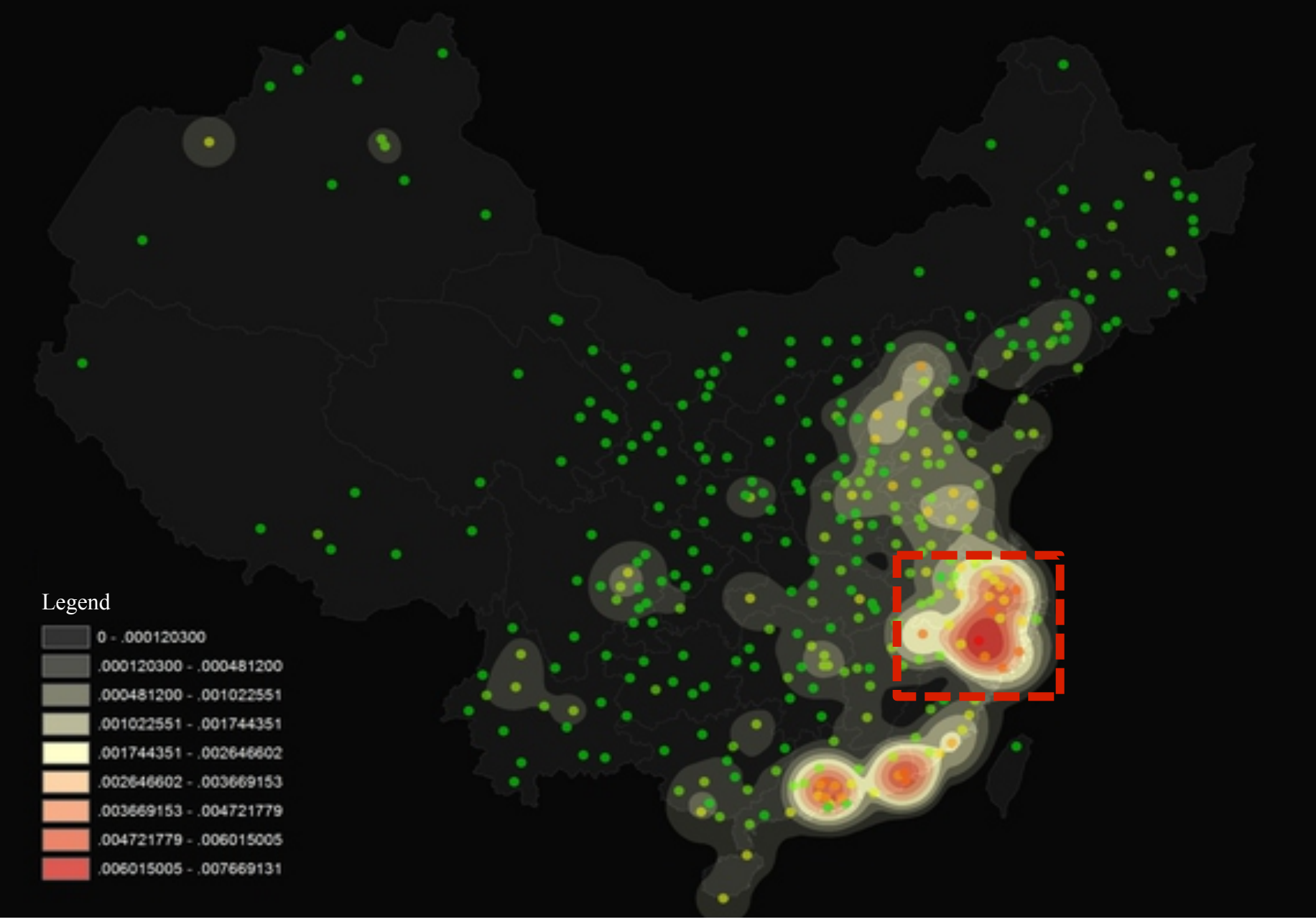
Quantity Kernel Density distribution of Taobao on-line commodity in prefecture-level(and above) city (According to commodity data from Taobao in December, 2014. Resource: David Leo Veksler/CC BY-SA)