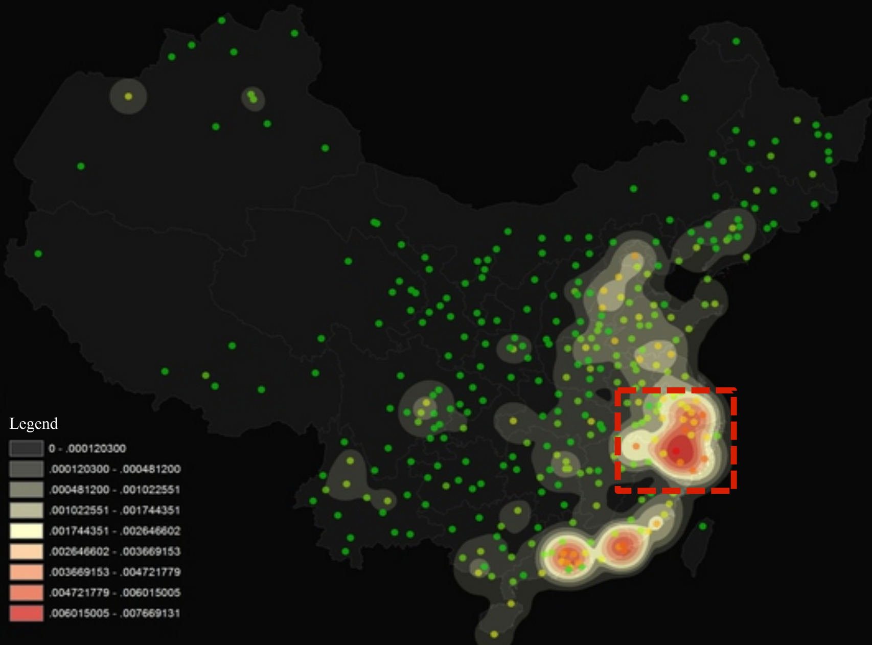
Quantity Kernel Density distribution of Taobao on-line commodity in prefecture-level(and above) city (According to commodity data from Taobao in December, 2014.)